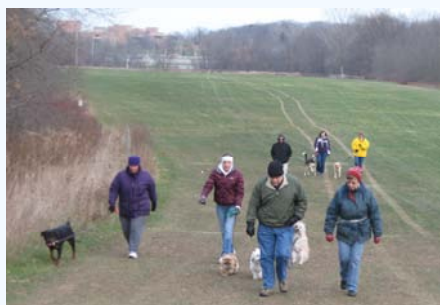
Hiking at Parkside's Cross Country Course

Winter is here, but that won't stop the Hiking Club! In fact, we had eight dogs (and their owners) brave the sleet and strong winds at the Marina on Sunday. The weather was miserable but somehow we managed to have a good time. I think it was the quickest 2-mile hike in the history of the Hiking Club!